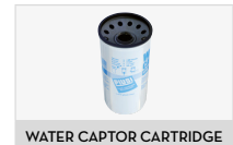
WATER CAPTOR CARTRIDGE