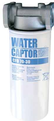
70 L/MIN WATER CAPTOR WITH WATER ABSORPTION