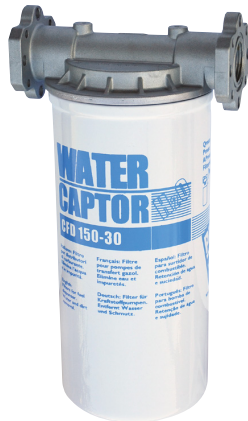
150 L/MIN WATER CAPTOR WITH WATER ABSORPTION