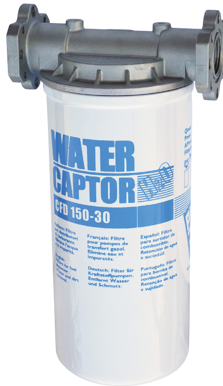
WATER CAPTOR 150 L/MIN