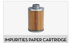
IMPURITIES PAPER CARTRIDGE