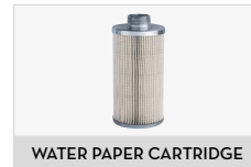
WATER PAPER CARTRIDGE